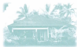
Halehuki circa 1940

American Cancer Society 1-800-227-2345 www.cancer.org